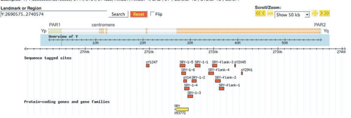
Figure 3. An example of query results. (A) Querying the database for STSs in the 50-kb interval surrounding sY14. (B) The queried interval contains 14 STSs. For each STS, the table lists sequence coordinates, PCR product length, primers, PCR conditions (as a link to a pop-up), GenBank accession number (as a link to the NCBI entry), and in the case of a multi-copy STS, sequence coordinates of co-amplified loci. (C) The custom Y chromosome browser indicates the location of the queried interval, and the identities and positions of all STSs and protein-coding genes within the interval.

Instructions: Search using an STS identifer, sequence coordinates, or gene symbol. Gene symbols may require a final asterisk wildcard to indicate a gene copy. You can also specify a gene (Gene:BPY2*) or an STS (STS:BPY2*). Examples: Y, Y:20000000..20100000, sY14, sY34, sY1229, AMELY, AMELY-4, DAZ*, sY*, Gene:BPY2*, STS:BPY2*, Gene:*.